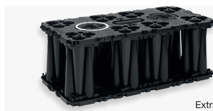
Extra strong stacking

* General indication for installation above groundwater level, according to instructions for single layer tanks. For multi-layer tanks the window of application may be limited. Wavin always recommends a minimum cover of 0,3 meter. For specific projects seek advice of Wavin.