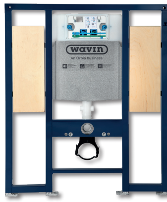
LaLinea WC Barrier free