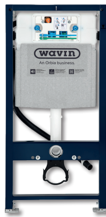
LaLinea WC Premium