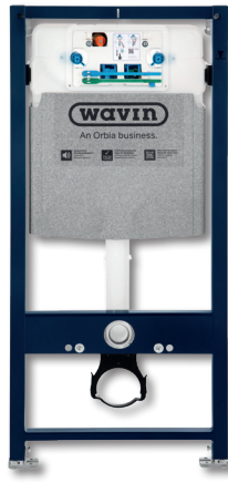
LaLinea WC Easy