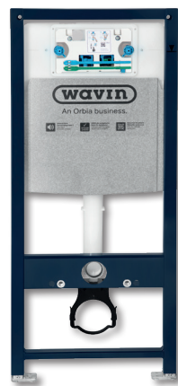
LaLinea WC 450 mm