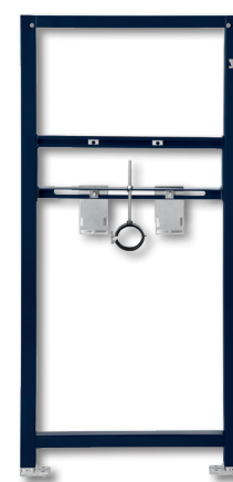
LaLinea Wash Basin