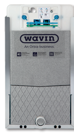
LaLinea WC Light