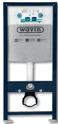
LaLinea WC Nordic P/P