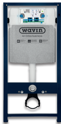
LaLinea WC Base

Elements - From Basic to Premium- One Range, All Options